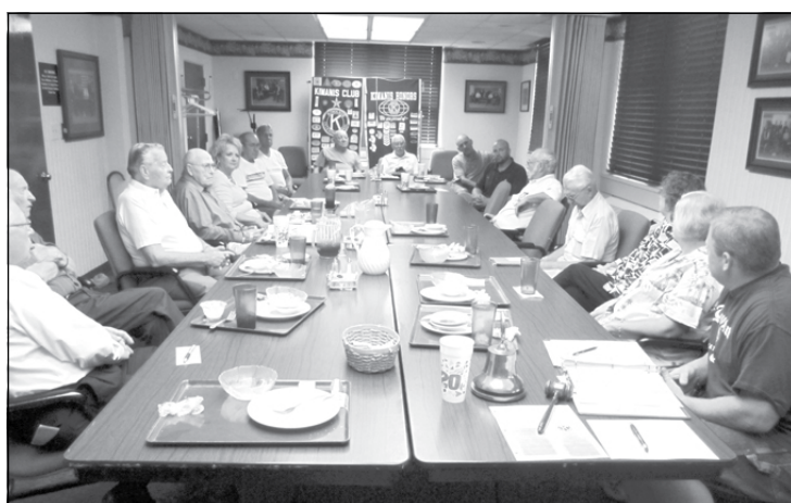
Last time meeting at "old" hospital - Pictured above is the Fairfax Kiwanis Club as they meet for the last time at the old hospital in Fairfax. The club will start meeting at the new hospital in October.

AUGUST - Character Ed. Word of the Month RESPONSIBILITY - Taking ownership of what you say and do.