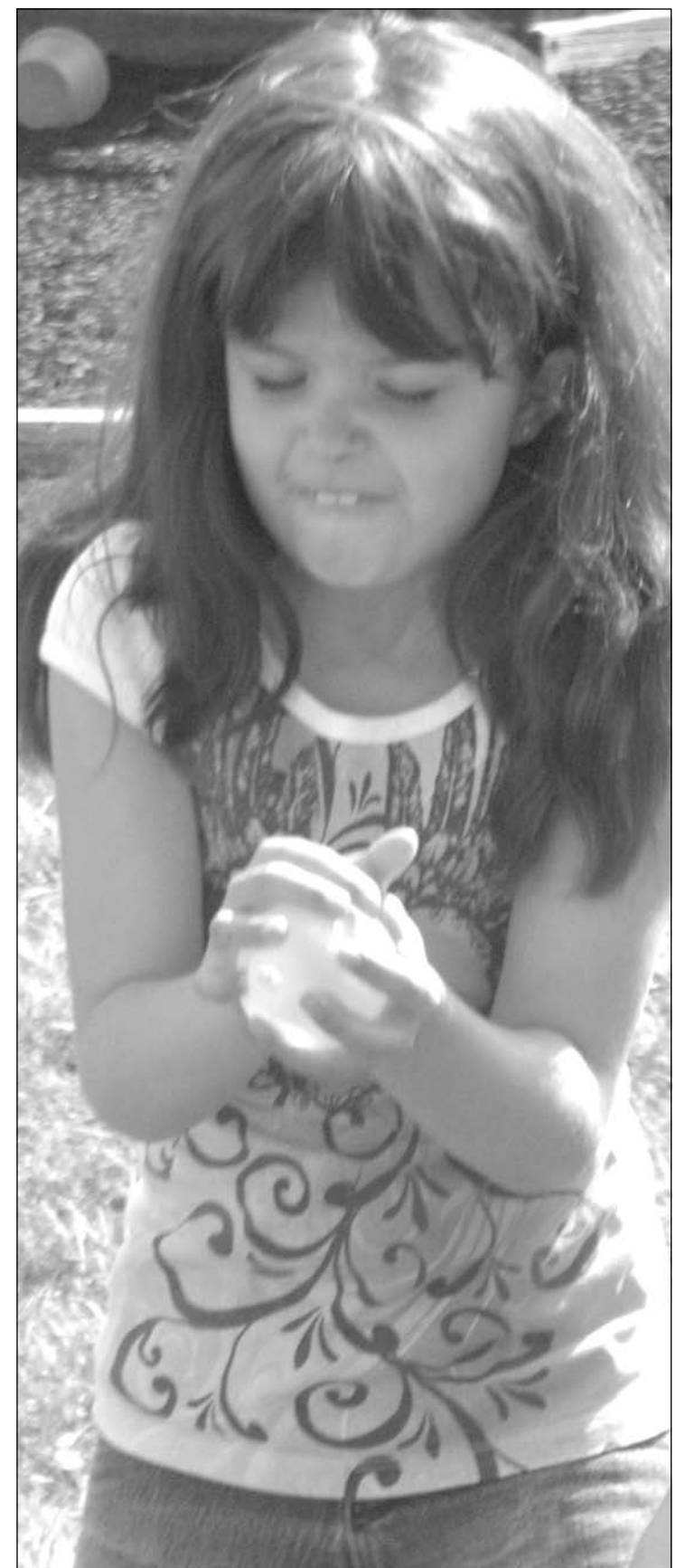
Water balloon toss